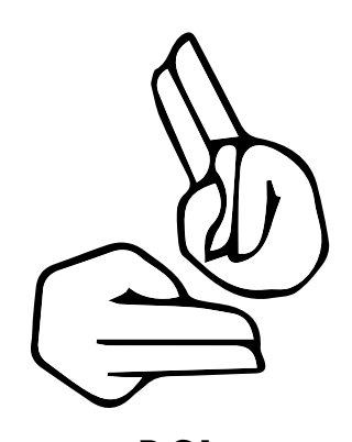
BSL Face to Face Interpreter

If you are Deaf and we need to meet you, we will book a BSL interpreter.